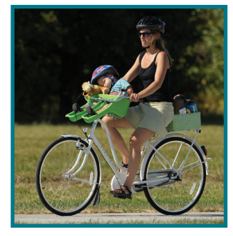
The Legacy Trail opened to the public on September 12, 2010. Enjoy your trail!

Feel free to plan your outing beginning at any point along the Trail – the North Lexington Family YMCA at 381 West Loudon Avenue, Coldstream Park off McGrathiana Avenue, or the North Legacy Trailhead at Ironworks Pike across from the Horse Park Campground. Plenty of parking is available to ensure that getting to and on the Legacy Trail is as easy as possible.